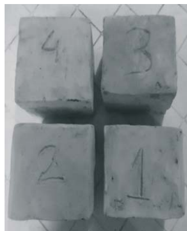
Figure 1. Image of different bricks (a) sample 1, (b) sample 2, (c) sample, 3 (d) sample 4

Concerning density a reduction in density is observed as mass fraction of sawdust in the original wet clay brick increases; this is clear since more volume will be occupied by sawdust before it burns leaving voids inside firing brick. This reduction in density will decrease cost and size necessary to achieve the task of insulation as thermal conductivity reduces. It is found experimentally that the escape of burning product from the porous brick due to high pressure which generates inside voids will leave voids having negligible mass of ash and gases with a pressure near the atmospheric pressure. A special brick is made to verify this situation where its core is filled with sawdust only then a vacuum chamber that has a double volume than that of the brick is used where the brick is crashed inside the chamber. Insignificant increase in the pressure is observed which may verify that a high pressure could not accumulate inside the voids.