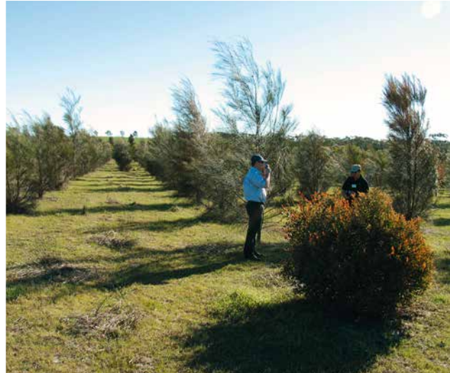
Salinized Landscape in Western Australia. Salinization was caused by conversion of the native Eucalyptus forest to wheat farming. Restoration by phase farming, where wheat is rotated with Eucalyptus (mallee), attempts to draw down the water table and flush salts from the soil. Carbon credits were to be gained from the restoration as a way to offset costs.

The National Adaptation Programs of Action (NAPAs) have been created for the specific purpose of dealing with the immediate climate change adaptation needs of Least Developed Countries (LDC). In keeping with their objective of providing urgent assistance, NAPAs are country-driven and action-oriented plans prepared without conducting new research. Instead, they use a synthesis of available information and a participatory assessment of vulnerability to the existing climate variability and to extreme climate events that have occurred in the country in recent years, set priorities for action, and identify key adaptation measures. The UNFCCC has laid down guidelines for NAPAs and also set up an LDC Expert Group to provide advice on the preparation and implementation strategies for NAPAs. As of 2013, 48 LDCs had submitted their NAPAs to the UNFCCC and almost all of these include forest-related measures among their adaptation priorities (UNFCCC, 2015a).