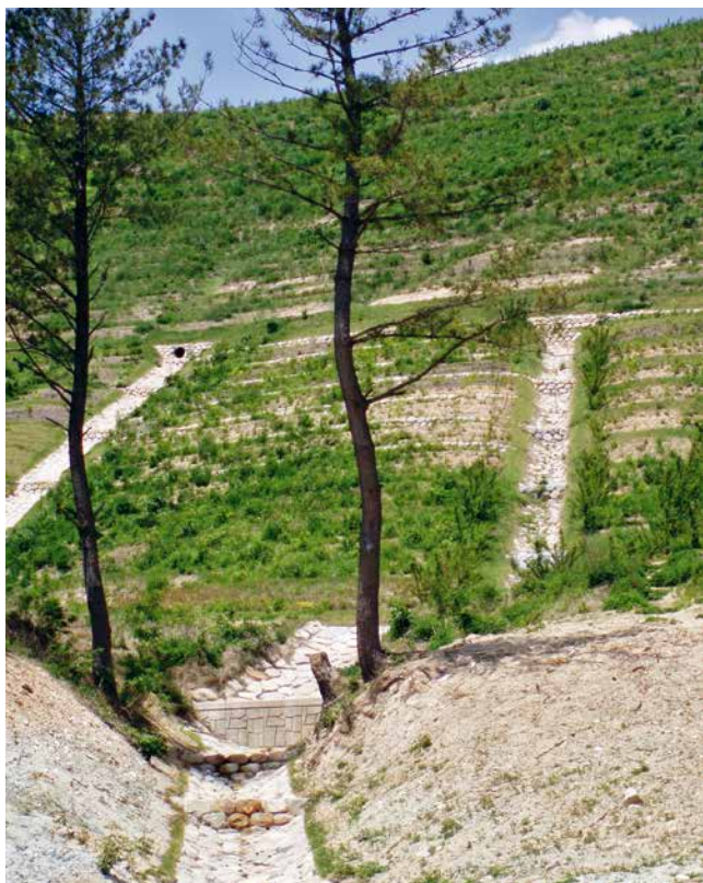
Hillslope restoration in Korea. Harsh conditions (eroded soils, droughty sites) required restoration using a combination of physical water control structures to control erosion and tree planting.

The most immediate effects of climate change likely will be on regeneration (Aitken et al., 2008; Pearson and Dawson, 2003). Overcoming regeneration barriers can lead to both incremental and anticipatory adaptation. Herbivory by domestic livestock and wild ungulates hamper regeneration of some forest species under current climate (e.g., deer in temperate forests, Côté et al., 2004) and herbivory may compound the vulnerability of some species that have lowered reproductive success in the future. Dispersal barriers may impede the ability of some species to migrate naturally under altered climate (Chen et al., 2011; Thomas, 2011). Even if impediments such as herbivory and