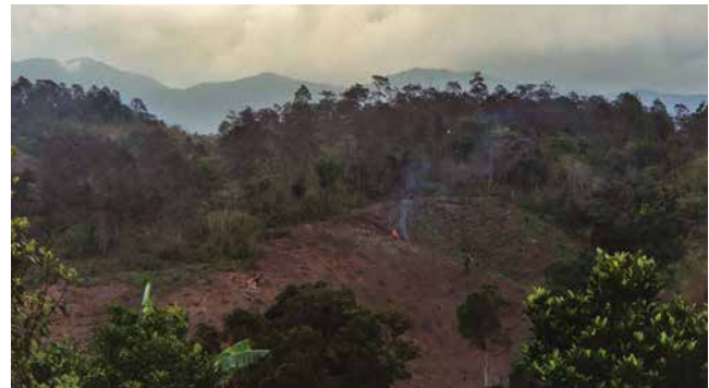
Forest degradation in the tropics. Land use change, including deforestation and forest degradation, is a major cause of carbon emissions.

Adaptation also has a spatial aspect. For example, maintaining forest area by reducing deforestation drivers (Table 5.2) may require national policy reform (e.g., Brazil) to curtail financial incentives to convert native forests to pasture for cattle. In a landscape, policy reforms may result in increased tenure security, which motivates investment in intensification of agricultural practices, thereby increasing crop yields on land already cleared and reducing the need to clear more land to compensate for reduced yields under altered climate. At a local (stand) scale, providing farmers with unambiguous ownership to planted trees both removes incentives to illegally fell trees that spontaneously regenerate on field margins and provides incentives to engage in agroforestry by planting trees on cropland.