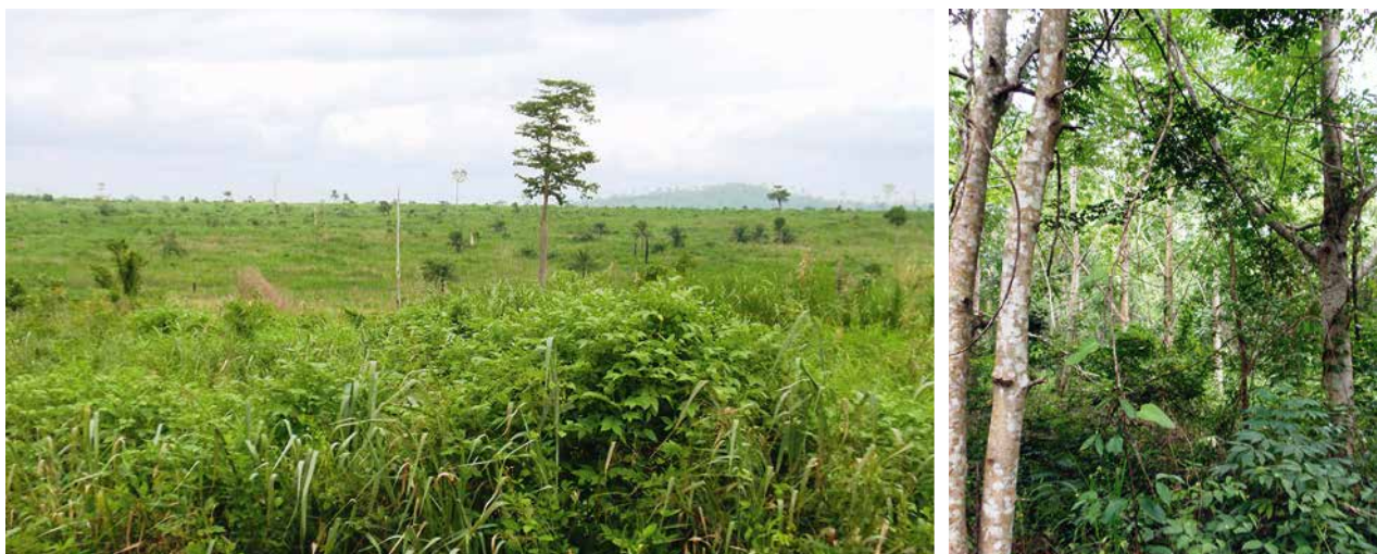
Degraded Pama Berekum Forest Reserve in Ghana. The forest reserve was degraded by harvesting without adequate regeneration, followed by wildfire and invasion of an exotic grass. Restoration by local farmers with native trees using the modified taungya system.