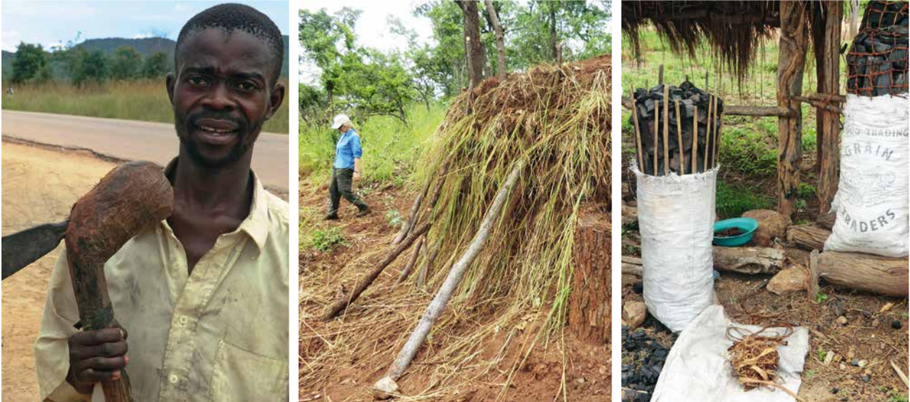
Charcoal production provides most of the residential energy used in Zambia but unsustainable methods are degrading the native miombo forest.

long-term storage of carbon. Mitigation interventions either reduce the sources of, or enhance the sinks for greenhouse gases (GHG) (IPCC, 2003). Carbon sequestration involves increasing forest area or the amount of carbon stocks per unit area. Activities include afforestation (conversion of non-forest areas to forest), reforestation (artificially regenerating forests after disturbance such as logging), and restoration aimed at increasing productivity and diversity of degraded forests.