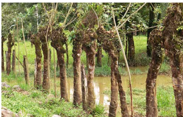
Representing one of the smallest forest landscape elements, trees on farms can already meet significant carbon mitigation objectives, besides many other ecological, economic and social functions – including as fence posts in Costa Rica.