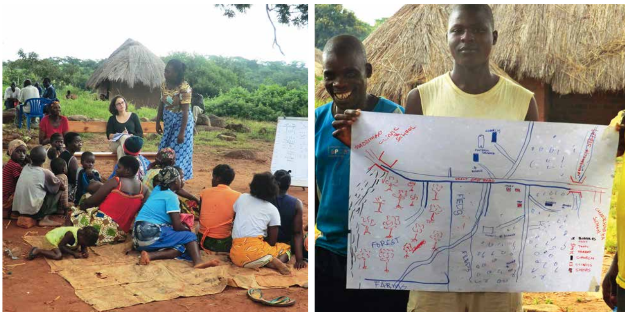
Landscape planning by local community in Zambia. Planning in gender-specific groups produced alternative visions for restoration.

deforestation, for example, is hard to achieve because of the need to involve many sectors, actors, and decision-makers in order to address the drivers and underlying causes of clearing forests.