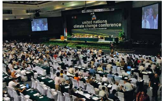
Negotiations at UNFCCC COP in Bali 2007, where the concept of reducing emissions from deforestation and forest degradation was discussed.

These developments provide a clear opportunity for integrated work on FLR and climate change mitigation and adaptation.