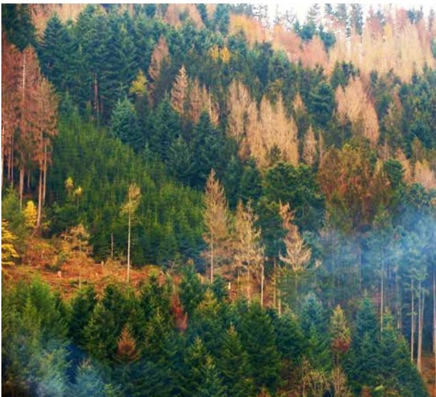
Extreme drought in 2003 in southern Germany stressed many forests and was followed by beetle kill. This extreme event provided an opportunity to convert planted conifer forests to broadleaves.