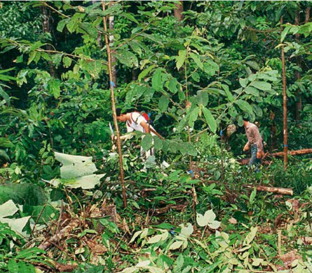
Tropical natural forest regeneration – tending operations of saplings.

objectives of restoration; that the seed will produce trees that are genetically adapted to the planting site; and the trees will generate products (whether for commercial or conservation purposes) within an acceptable time span and of an acceptable quality (Graudal and Lillesø, 2007; Lillesø et al., 2011).