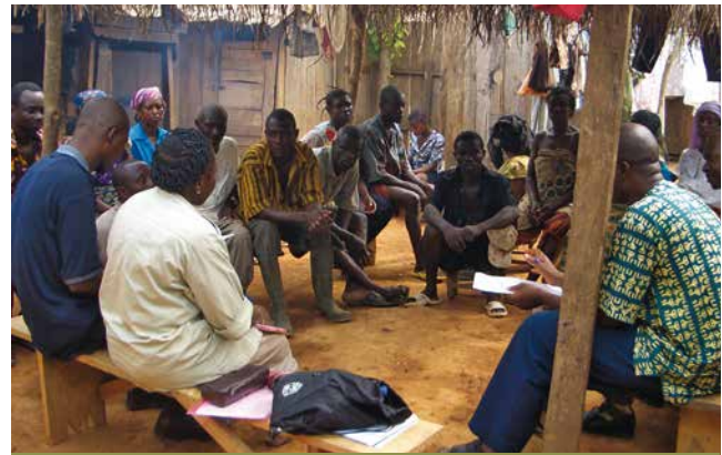
Community consultations on forest landscape restoration in Ghana. Restoration projects strongly depend on capacity building, planning and information components.