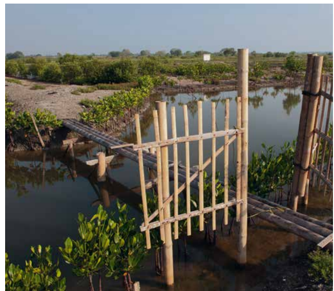
Mangrove nursery, Pulau Dua Natural Reserve, Indonesia. Protective function of mangrove forests against coastal erosion or storm surge is invaluable and gaining even more importance in respect of climate change.

A typology of adaptation actions developed from activities financed by the Global Environment Facility includes the following: capacity building; management and planning; practice or behavior; policy; information; physical infrastructure; warning or observing systems; green infrastructure; financing; and technology (Biagini et al., 2014). The activities directly relevant to FLR mostly fall into the categories of practice and behavior, green infrastructure, and technology, while FLR often benefits from policy changes and improvements in national management and planning. Practice and behavior refer to revised or expanded practices that relate directly to building resilience, such as thinning stands to reduce transpiration loss as an adaptation to drought (Allen et al., 2010; D'Amato et al., 2013; Kohler et al., 2010) or by introducing genetically diverse planting material to improve adaptive capacity (Graudal et al. 2014a; Alfaro et al. 2014). Green infrastructure describes new or improved natural infrastructure that provides direct