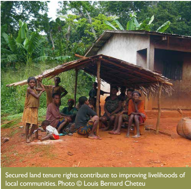
Secured land tenure rights contribute to improving livelihoods of local communities.

Policies and strategies that make for successful FLR include a secure legal foundation, supportive national and sub-national policies, and effective enforcement of the laws governing use of natural resources (IUCN and WRI, 2014). Critical legal aspects that affect restoration as well as mitigation activities such as REDD are tenure and use rights, and participation by those affected (including Free Prior and Informed Consent; (Barr and Sayer, 2012)). For many rural populations in developing countries landscape restoration inside and outside forest land is often more a question of governance, equity, and rights as it is a technical question of planting trees (Holden et al., 2013a; Robinson et al., 2014). Unfortunately, this can lead to the wrong conclusion that the technical part is easy and needs less – or even no – attention, leading to wide spread planting disasters (Graudal and Lillesø, 2007).