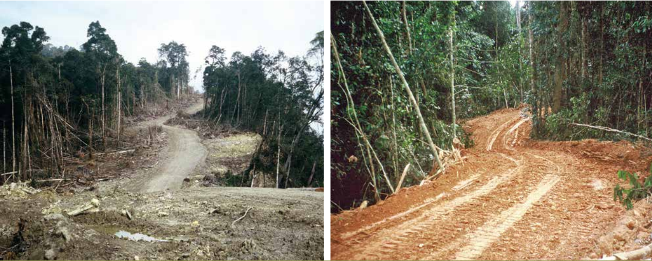
Maintaining forest area involves decisions and actions at several levels. Instead of destructive construction of roads, careful planning brings reduced environmental impact including forest area, watershed benefits and preventing natural disasters, such as landslides.

(Chazdon, 2015), or may require only remedial measure such as enrichment planting (Ådjers et al., 1995; Elliott et al., 2012). Other policy reforms implemented at the stand, landscape, or national level to reduce or avoid forest degradation include securing tenure, implementing sustainable landscape (ecosystem) and forest management, and effective protection. In addition to maintaining current carbon stocks, adequately protecting existing forests may enable local adaptation to climate change by native species (Nicotra et al., 2010; Thomas et al., 2014; Valladares et al., 2014). Where current laws allow participatory forest management through mechanisms such as community forests, joint forest management, or wildlife conservation areas, integrating these efforts with local governance structures will increase the likelihood of success, as opposed to erecting new, stand-alone management structures.