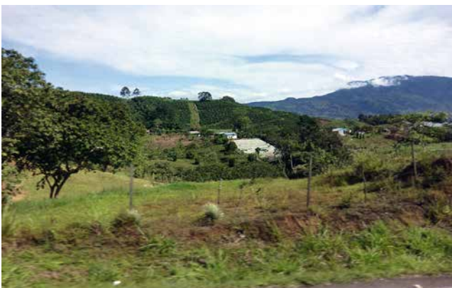
Rural scenery in Costa Rica. Appropriate distribution of forests, trees and agricultural crops contributes to climate objectives, productivity and several other social benefits.

International conventions and facilitation processes can provide the right external environment for forest landscape restoration but these would amount to little unless national policies and governance systems enable good quality planning and implementation of FLR, creating employment, incomes and other incentives for communities to involve themselves in the efforts. It is striking to see how far the international policy framework has developed and continues to develop; but how little FLR has been implemented in practice, in particular in developing countries (with some notable exceptions) where the potential is greatest. Most focus to date has been on governance structures with the implicit assumption that the technical challenges would be easier to overcome. However, this is rarely the case. Institutions to guide and implement are often weak and their technical and operational capacity limited (FAO 2014a; Graudal et al. 2014a). Furthermore, in many cases the weakest and most vulnerable sections of the society would have to be kept at the center to obtain lasting results. Without such conditions, the success of FLR would only be superficial at best, planting trees that barely survive, contributing little to the local economy, and even less to the ecosystem.