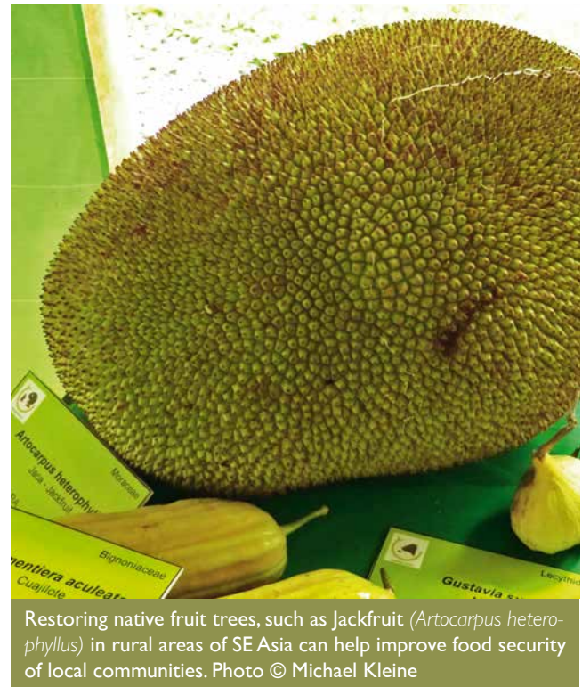
Restoring native fruit trees, such as Jackfruit ( Artocarpus heterophyllus ) in rural areas of SE Asia can help improve food security of local communities.

Extreme events such as natural disasters can create a window of opportunity for transformative activity (Pelling and Dill, 2010; Young, 2010), temporarily lowering institutional and social barriers to change, allowing for “directed transformation” by institutions (Nelson et al., 2007). For example, after the 2009 “Black Saturday” megafire in Victoria state, Australia (Cruz et al., 2012), O'Neill and Handmer (2012) proposed four areas for transforming bushfire risk: reducing hazardous fuels, lowering exposure of infrastructure and buildings, reducing vulnerability of the population, and increasing adaptive capacity of institutions. They acknowledge the difficulty of transformative adaptation and note the vigorous resistance from the public to specific recommendations