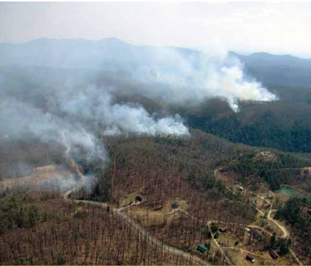
Restoring natural fire regimes in broadleaf forests in the Southern Appalachian Mountains, USA.

with different ‘entry points’. Climate change mitigation and adaptation is one such entry point and increasingly, it is being integrated into resource management strategies. For example, Ecosystem Based Adaptation (EbA) is the use of biodiversity and ecosystem services as part of an overall adaptation strategy to help people and communities adapt to the negative effects of climate change at local, national, regional and global levels. EbA also has multiple co-benefits for mitigation, protection of livelihoods and poverty alleviation (Munang et al., 2013). Forest landscape restoration is another such entry point.