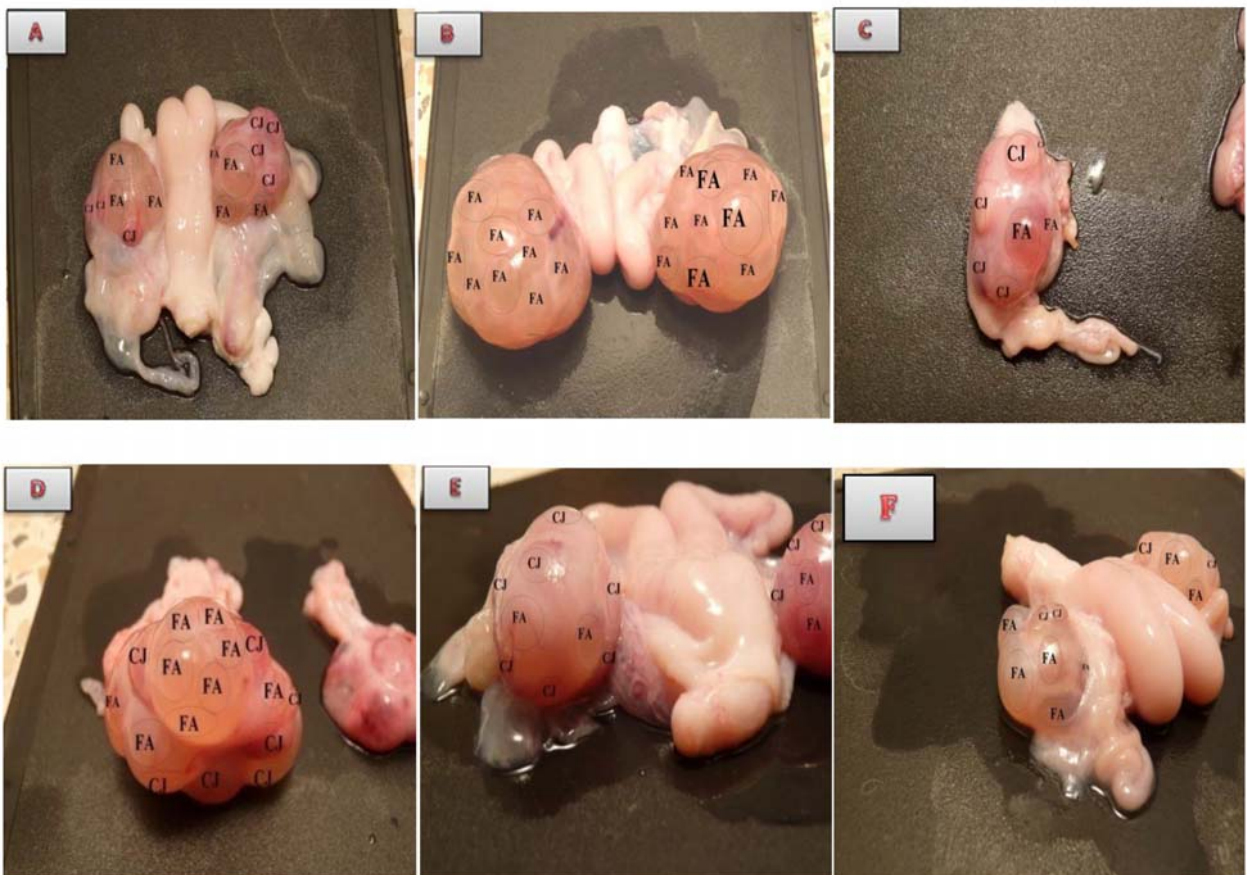
Figure 3: Ewes' ovary in T2*.

T1*(PMSG 1000IU); CL (Corpora Lutea); AF (Anovulatory Follicles); A, B and C (superovulated ewes).