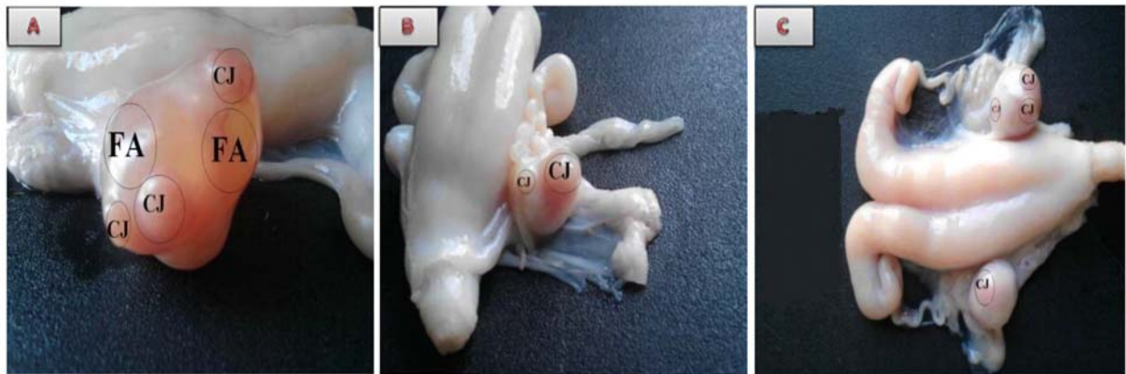
Figure 2: Ewes' ovary in T1*.

T1*(PMSG 1000IU); CL (Corpora Lutea); AF (Anovulatory Follicles); A, B and C (superovulated ewes).