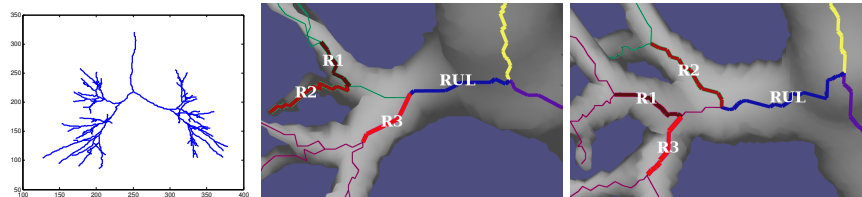
Fig. 1. Left: The method takes only the airway centerline tree as input. Middle-right: Airway trees are frequently topologically different, while geometric differences are small.

Several types of airway branch labeling algorithms have appeared previously. Van Ginneken et al. [11] and Lo et al. [5] use machine learning on branch features, with additional assumptions on airway tree topology. Among the features used are branch length, radius, orientation, cross-sectional shape and bifurcation angle. Branch length and radius are sensitive to the presence of structural noise or diseases like cystic fibrosis, tuberculosis or Chronic Obstructive Pulmonary Disease (COPD), and assumptions on tree topology make these methods vulnerable to topological differences. Tschirren et al. use association graphs [10] for pairs of airway trees, which incorporate information from both trees, such that maximal cliques in the association graph induce branch matchings between the original graphs. This is a combinatorial construction, although it can depend on the geometric properties of the initial trees. Such a separation of geometric and combinatorial properties can be problematic, as airway trees are often geometrically and visually similar despite being combinatorially different, as in Fig. 1. Feragen et al. [2] label airways based on geodesics (shortest paths) in a space of trees. Their tree-space is highly non-linear and has no known efficient algorithm for geodesic computation, making labeling of a complete airway tree infeasible.