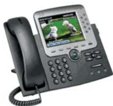
Figure 3. Telephone with VoIP motherboard

In better developed countries like U.S.A., Great Britain etc., people started to buy telephones with VoIP included in the motherboard of the phone, but with a bigger security when it comes to voice calls. These phones can register the calls in a data base where it will last a week or maybe more, this depending on the user of the telephone. Such telephones can be bought online and is represented in figure 2.2.