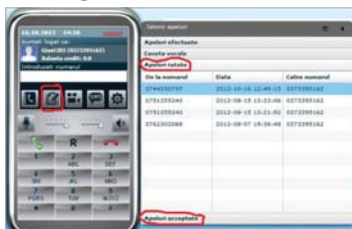
Figure 5. Calls received or missed on VoIP

Even this type of network cost money. For example for the VoIP accounts which are not recharged with credit will be available maximum 3 months, but you can create a new account after the old one expired using a different e-mail address. This law is available for all types of VoIP networks which exist on the World Wide Web.