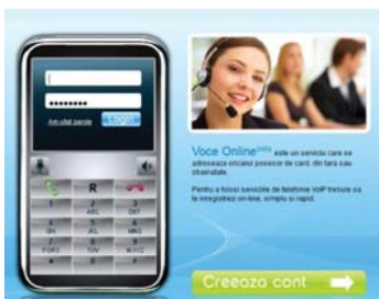
Figure 4. Mobile VoIP

At the GPRS system the moment you are called and redirected the phone call it will take a second to decode the number. You can see the phone number by accessing the VoIP account you have created, accessing history calls where you will see missed calls, received calls, dialed calls and others, visible in Figure 2.4 .