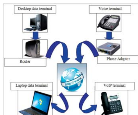
Figure 1. VoIP system

- The information will replace the indetermination [3].