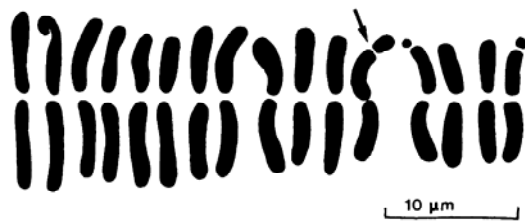
Fig. 2. Karyogram from plant at locus classicus . Note absence of obvious anisobrachial chromosomes (sm or st) and presence of an unusual type of SAT-chromosome (arrowed).