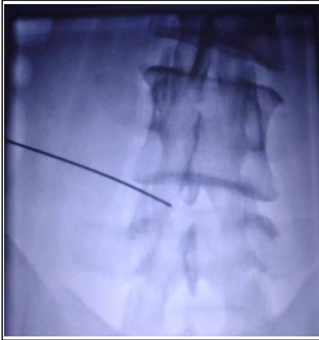
Fig 3-Lateral View of L-S Spine (showing position of the needle)