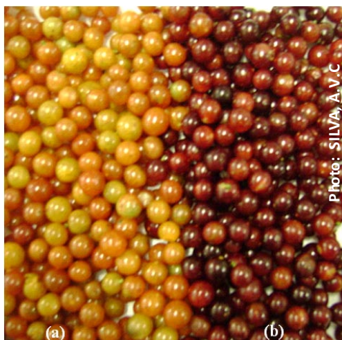
Figure 3- Fruits of cambuí ( Myrciaria tenella O. Berg) from Reserva Ecológica do Caju, Itaporanga d'Ajuda (Sergipe, Brazil), belonging to Embrapa Tabuleiros Costeiros (Embrapa – CPATC): (a) yellow and (b) purple.

93A)], with red pulp [red - purple (group 60A)]. During fieldwork, it was common to find both colors of ripe fruits in the same tree.