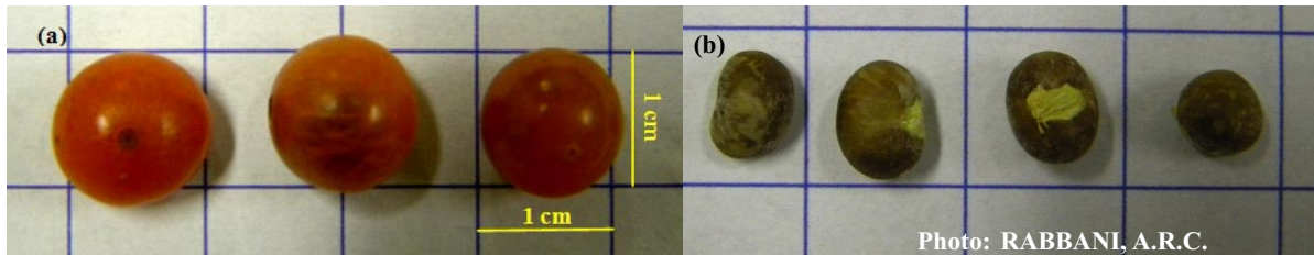
Figure 1 - Fruits (a) and seeds (b) of cambuí ( Myrciaria tenella O. Berg) from Reserva Ecológica do Caju, Itaporanga d’Ajuda (Sergipe, Brazil), belonging to Embrapa Tabuleiros Costeiros (Embrapa – CPATC).