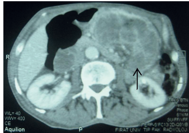
Figure 1. Computed tomography cross-section of a large necrotic tumor filled gastric body.

He had been suffering for 4 months from epigastric pain and for a week from black stool. He had lost approximately 10 kg in body weight. He had not any significant medical history. The family history was negative for familial or hereditary disease. On examination, the patient was pale because of severe anemia, and had an ill-defined immobile epigastric mass, approximately 8 cm by 15 cm in size. Supraclavicular, axillary and inguinal lymph nodes were not palpable. There was not any mass in the rectal digital examination, but there was mealena. Initial laboratory study results were normal, except for hemoglobin, at 8.6 g/dl, and a hematocrit of 25.9 per cent. Computed tomography (CT) of the abdomen demonstrated a large necrotic tumor filled the 2 to 3 of stomach, and multiple lymphadenopathies with necrotic areas in the celiac axis (Figure 1). As to tumor markers, serum carcinoembryonic antigen (CEA), alpha-fetoprotein (AFP), and carbohydrate antigen (CA) 19-9 levels were within normal limits.