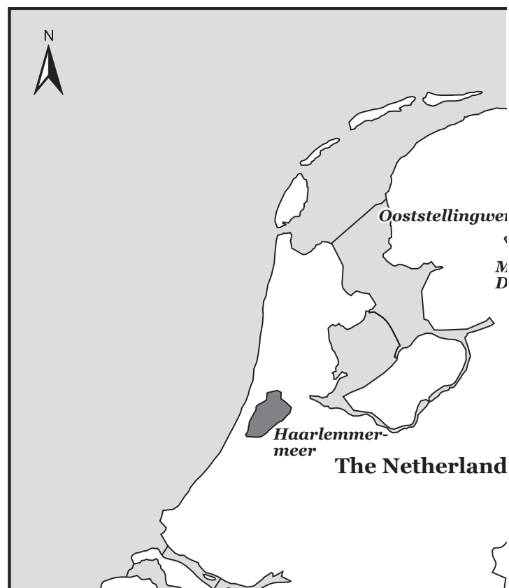
Map 1: The municipalities studied