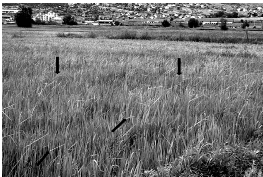
Fig. 1 — Visible symptoms in the field caused by Gibberella fujikuroi

Plant material with symptoms similar to that caused by Gibberella fujikuroi , was collected from rice ( Oryza sativa ) during the period of 3 years (2006—2008). Each year, collections were made throughout the whole rice growing season. The seedlings with early symptoms of Bakanae disease, particularly chlorosis and elongation, were collected from rice fields in Kočani areas. Later in the season, plants showed visible symptoms in the field (Figure 1). During this period, 10 different fields were observed, and 5 infected sam-