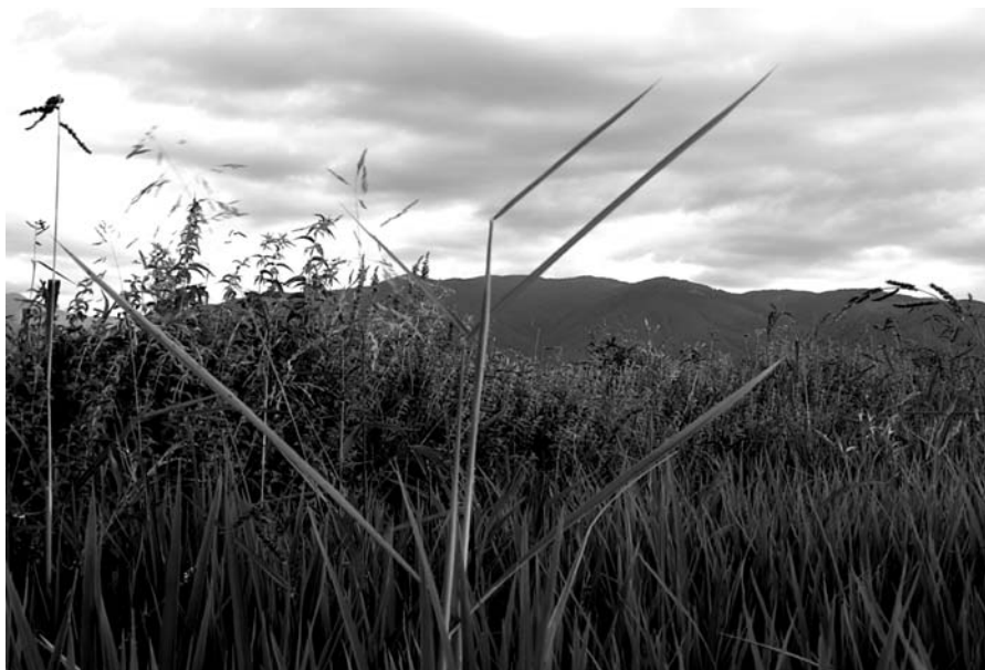
Fig. 2 — Abnormal oblong stem and leaves

ples, were collected. Symptomatic plants have thin stem, 30 cm higher than normal, and leaves are usually yellowish green and elongated in comparison with normal leaves (Figure 2).