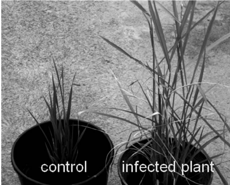
Fig. 3 — Test of pathogenicity — control with sterile water and infected plant with suspension from Gibberella fujikuroi

an open environment and data for Bakanae symptoms, expressed in percentage of plant infection were evaluated 60 days after sowing.