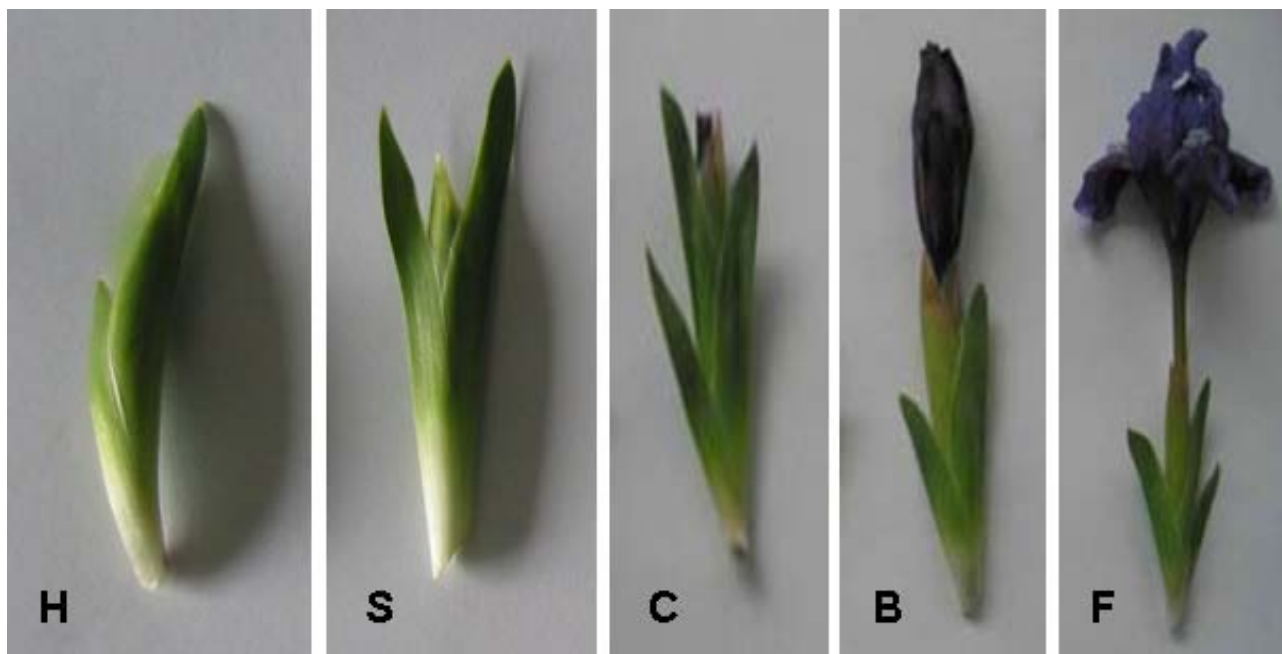
Fig. 1. Analyzed bud stages in development of I. pumila flower: Hidden bud stage (H), Spathes stage (S), Colored bud stage (C), Final bud stage (B) and Open flower stage (F). For description of each stage see Material and methods section

out on clone means by ANOVA with Habitat and Stage as the main factors. For pairwise comparisons between stages, the Scheffé test was used. All statistical testing was done by SAS program (SAS 1989) PROC MEANS and PROC GLM procedures.