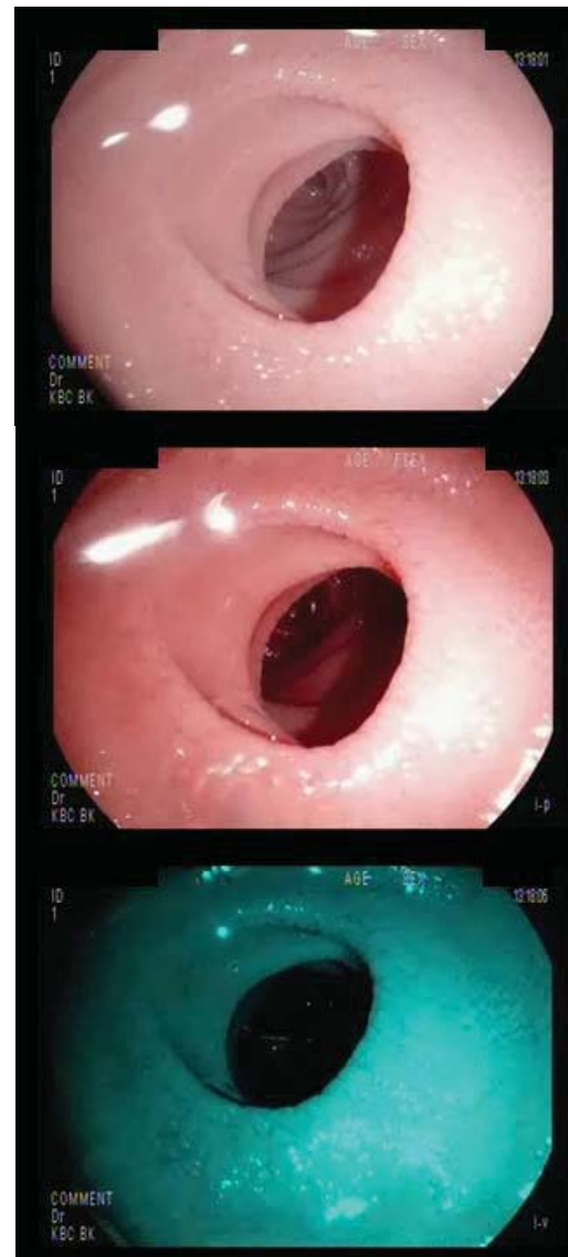
Fig. 2 – Endoscopic appearance of atrophic duodenal mucosa (with and without i-scan surface enhancement)

RU/mL). Upper gastrointestinal endoscopy revealed atrophic macroscopic appearance in duodenum (Figure 2). Histopathology examination of duodenal biopsy specimen revealed type IIIb lesions according to the Marsh-Oberhuber classification. Osteodensitometry displayed a normal bone mineral density.