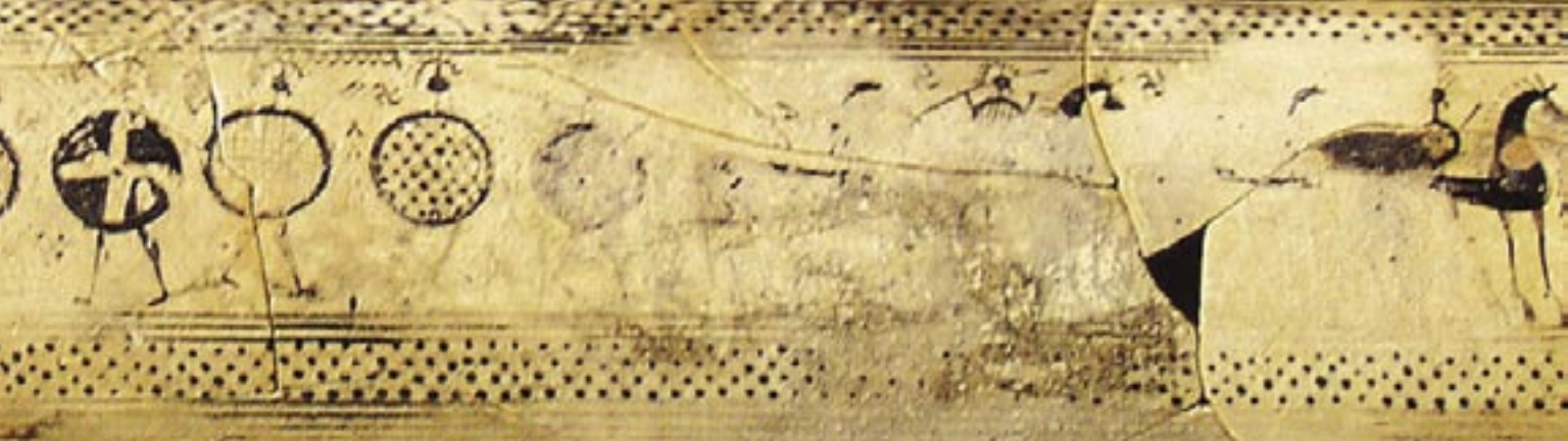
Ilias Iliadis, courtesy F. Zafeiropoulou

Detail of a vase dated to ca. 730 B.C. (above) shows cavalry, archers, slingers, and hoplites. An iron spearhead fragment found in one burial vase still has pieces of bone adhering to it.