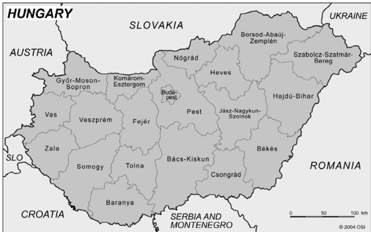
Fig. 2. Counties [megye] in Hungary