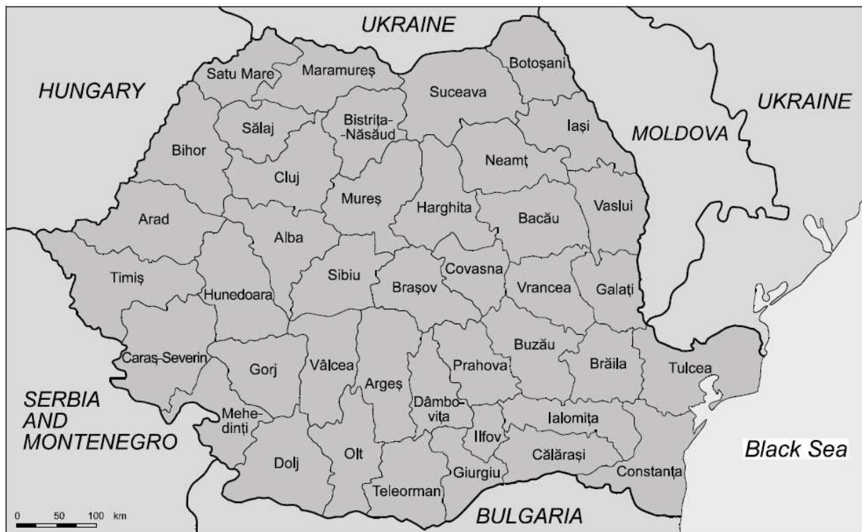
Fig.3. Counties [județ] in Romania