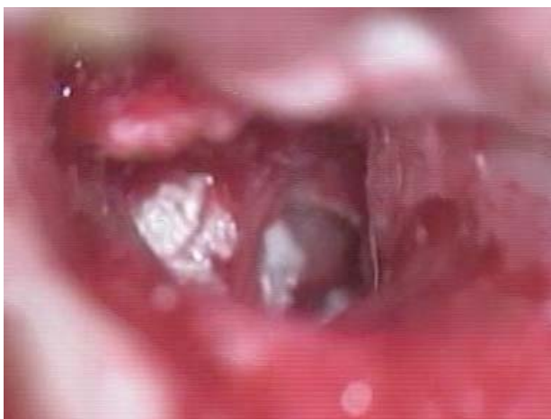
Fig. 2 – Intraoperative findings showing a cholesteatoma in the fossa ovalis.

Based on these findings, explorative surgery was performed on the right ear with the presumptive diagnosis of otosclerosis. Open type cholesteatoma was found obliterating oval window (Figure 2). The long process of incus and head