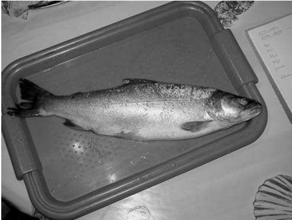
Fig. 3. Dentex trout, Salmo dentex from the Neretva River and Hutovo blato wetlands streams.

Slika 3. Zubatak, Salmo dentex, iz rijeke Neretve i močvara Hutova blata.