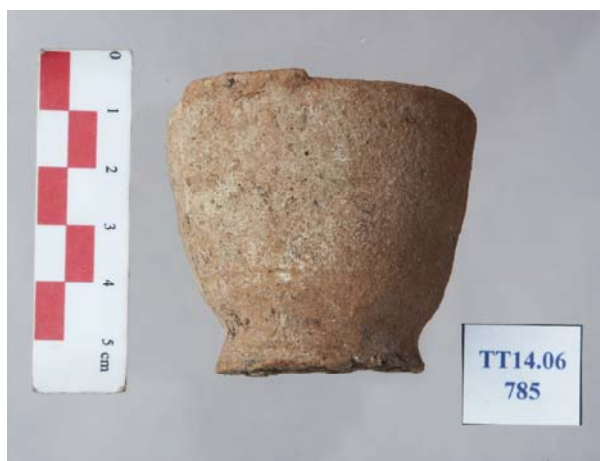
Fig. 1. The ceramic vessel from which residues for GC/MS analysis were sampled.