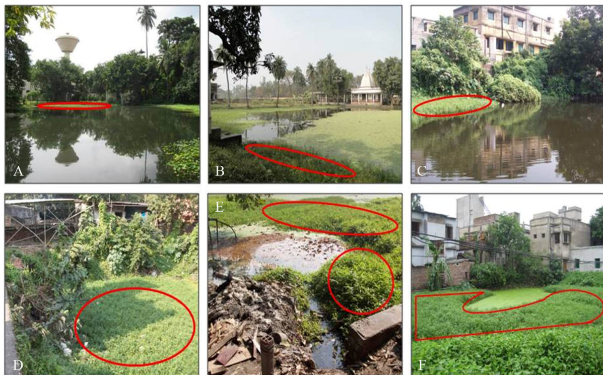
Figure 1. Six of the study ponds showing different degrees of Alternanthera philoxeroides infestation and pollution influx. A: Pond 1 (Amrapali), B: Pond 2 (Dakshineswar), C: Pond 3 (Bidyatan Sarani), D: Pond 8 (Kancher Mandir – 1), E: Pond 10 (Belghoria), F: Pond 11 (Tantipara). Red outlined areas in the photographs show regions of A. philoxeroides infestation (Photographs by Anindita Chatterjee).