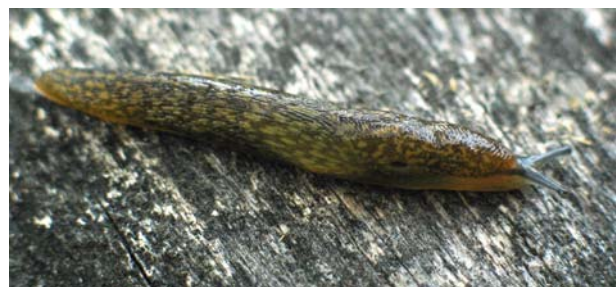
Fig. 2. Limacus flavus from locality No. 51 (Olmouc).

There were found 31 species in 73 cellars. In this type of shelters are comprised big cellars of significant buildings (castles, monasteries), as well as little cellars in houses, used cellars in rock and other man-made and man-used subterranean spaces (except military bunkers). The highest representation contains following species: Limax maximus (30 localities), Helix pomatia (26), Oxychilus cellarius (23), Arianta arbustorum (17), and Cepaea hortensis (15). All mentioned species occur in cellars with a higher frequency than in galleries, for example. Other species typical for cellars are Trichia hispida (17 localities, 11 are cellars), Oxychilus draparnaudi (its all 9 localities are cellars), Arion fasciatus (4), and Boettgerilla pallens (3). The majority of species occurring in cellars (ca. 50%) forms euryoecious species. Very interesting species is Limacus flavus (Fig. 2). Only two localities of this species are known in the past two decades from the Czech Republic: Prague – Košíře, Zapova street, 1991, LOŽEK in JUŘIČKOVÁ (1995), and locality No. 51 of this study. L. flavus was firstly recorded at this locality on the 3 rd of Sep 2003 (M. Maňas and M. Kotal, 2 ex.), than on the 14 th of Nov 2003 (L. Dvořák and M. Maňas, 2 ex.). Data from East Germany show (BAADE 2003), that this species is not as rare as thought and can be found at suitable stands in some regions.