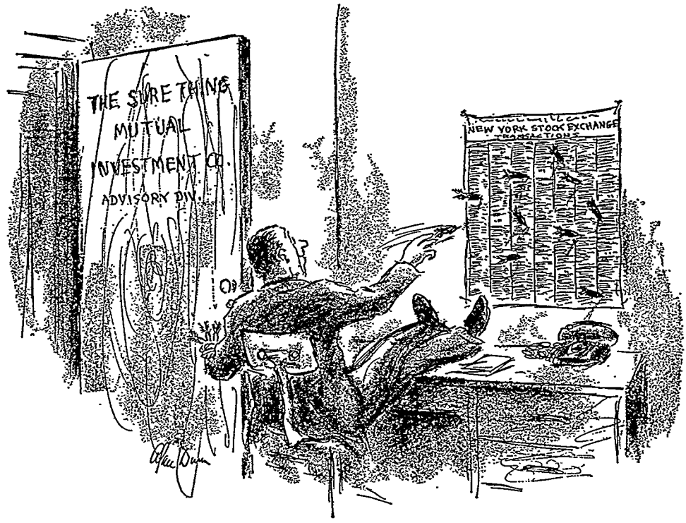
Drawing by Alan Dunn; © 1967 The New Yorker Magazine, Inc.