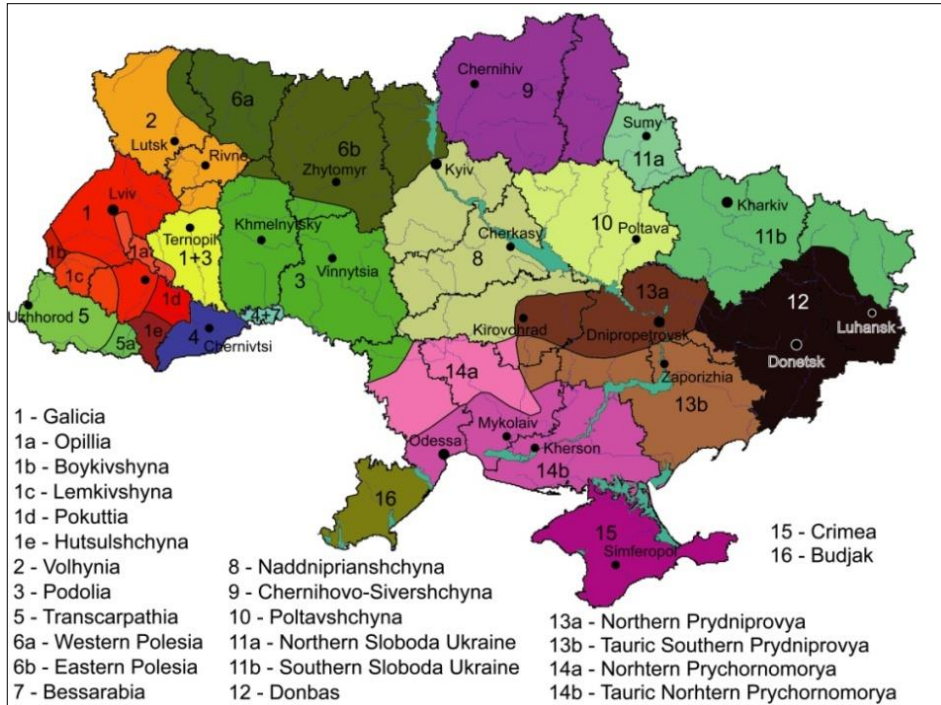
Fig.3 Sub-ethnic identity regions in Ukraine (according to the authors' data)

However, we do not claim absolute accuracy and objectivity of isolated regions. To clarify further the question is necessary to use other markers, as well as other methodological approaches to the study of territorial identity.