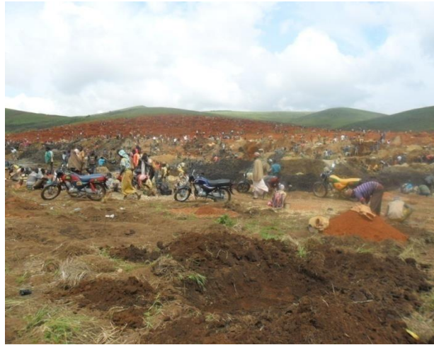
Figure 2. Beehive of Activities at the Mining Site