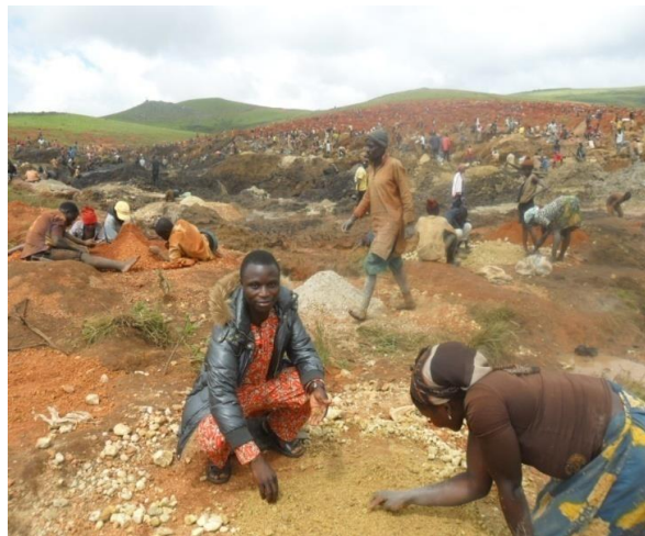
Figure 3. Sorting out of Sapphire from Gravels