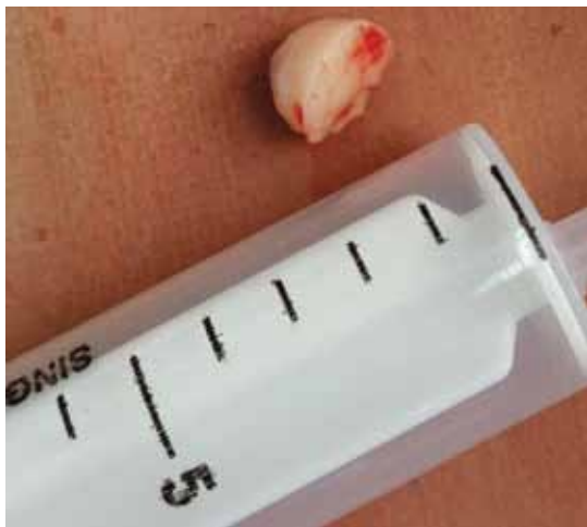
Fig. 3: Excised exostosis

was used. Panoramic radiograph revealed a 1 × 1 cm well circumscribed radiopaque mass, oblong shaped in mandible right molar region, lying above the mandibular canal (Fig. 1). There was no evidence of residual root in mandibular molar region.