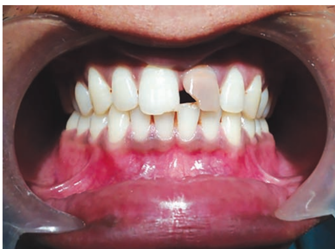
Fig. 1: Preoperative photograph

The goal of this treatment was to obtain an apical barrier to prevent the passage of bacterial toxins into the periapical tissues from the root canal and technically this barrier is necessary for compaction of root filling material during obturation. 9,10 Promoted as a dentin substitute, Biodentine (Septodont, Saint Maur des Fosses, France) can also be used as an endodontic repair material. In its composition the powder mainly consists of tricalcium silicate, with the addition to the powder of CaCO 3 and ZrO 2 while