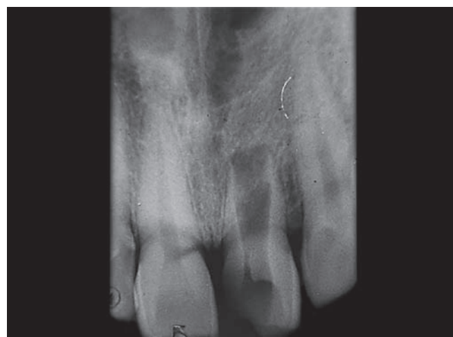
Fig. 2: Preoperative IOPAR