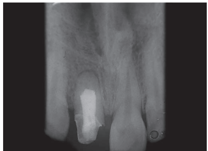
Fig. 8: Follow-up IOPAR (1 year)

from pulp progenitor cells. Biodentine has shown to stimulate dentin regeneration as reported by About et al. 14 As reported by Han and Okiji, calcium and silicon uptake by adjacent root canal dentin in the presence of phosphate buffered saline was greater for Biodentine