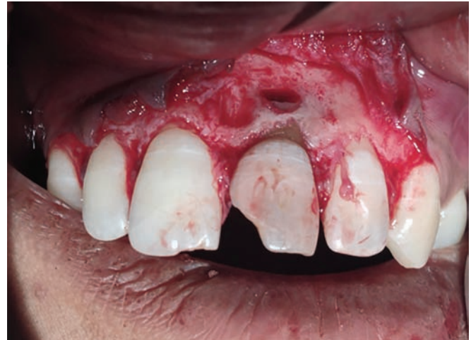
Fig. 5: Surgical flap raised