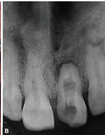
Figs 6A and B: (A) Retrograde filling and (B) post-surgery IOPAR with biodentine