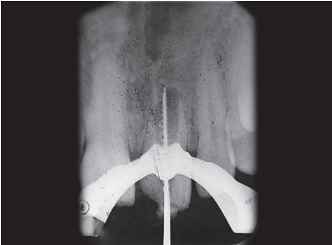
Fig. 4: Working length IOPAR