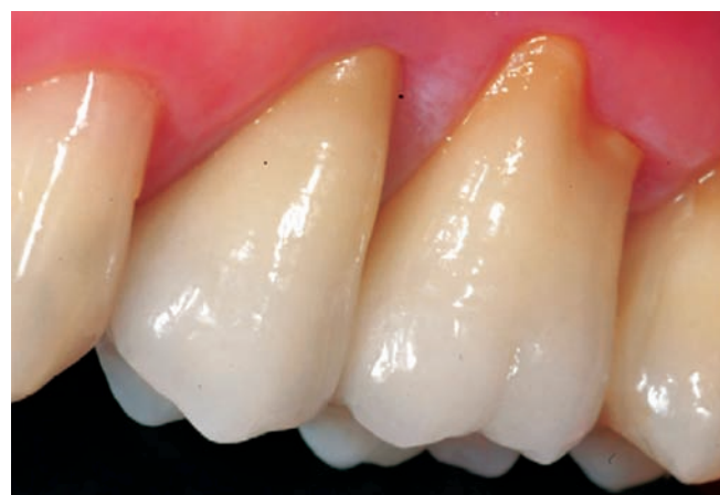
Fig. 4: Cemented zirconia-ceramic crowns