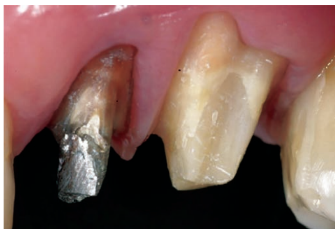
Fig. 3: Prepared discolored non-vital teeth

Zirconia restorations have found their indications for FPD supported by teeth or implants. Single tooth restorations and FPD with a single pontic element are possible on both anterior and posterior elements because of the mechanical reliability of this material. 27-29 It is possible to use juxtagingival marginal preparations and various