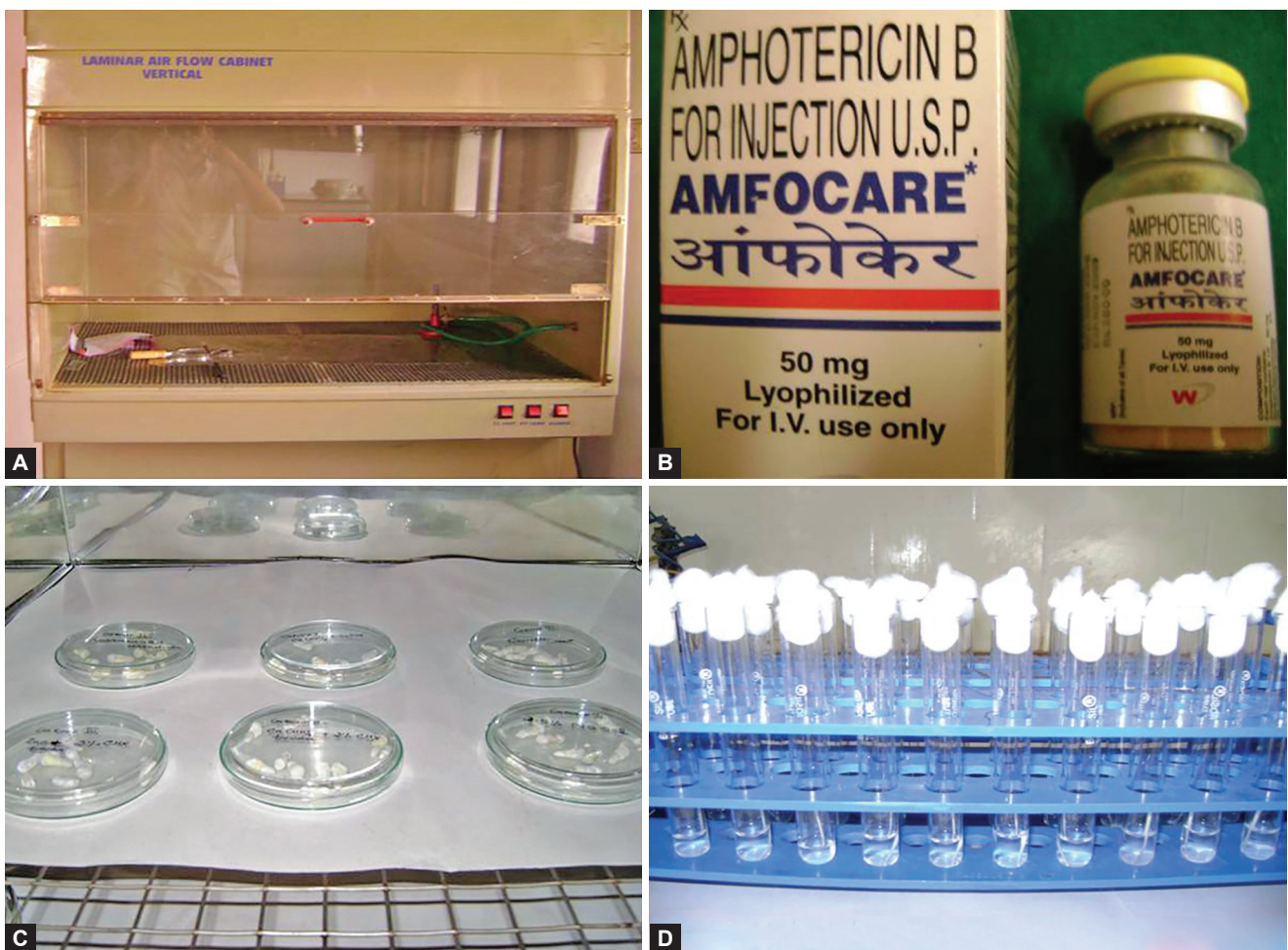
Figs 1A to D: (A) Laminar flux chamber, (B) amphotericin B ampule, (C) roots are incubated at 37 \pm 10^\circ\text{C} for 14 days in an incubator and (D) sterile paper points placed in a test tube containing 1 ml sterile saline

2.5% NaOCl was effective in 90% of the samples followed in decreasing order of effectiveness by amphotericin B powder and distilled water (80% effectiveness), ZnO powder and 2% CHX (70% effectiveness), Ca(OH) 2 powder and 2% CHX (60% effectiveness), Ca(OH) 2 powder and saline (50% effectiveness) and saline + no intracanal medication.