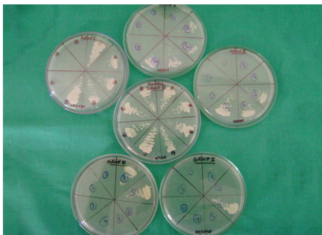
Fig. 2: Fungi growth on Sabouraud dextrose agar plates with chloramphenicol (1 mg/ml) after 48 hours