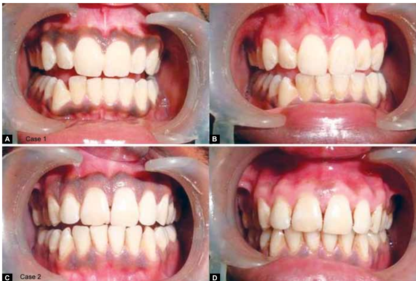
Figs 3A to D: (A and B) Preoperative and 1 year postoperative of case 1, (C and D) preoperative and 1 year postoperative of case 2

duration. Thus, the mixed results were seen with different techniques. Some were positive while some were negative for repigmentation occurrence.