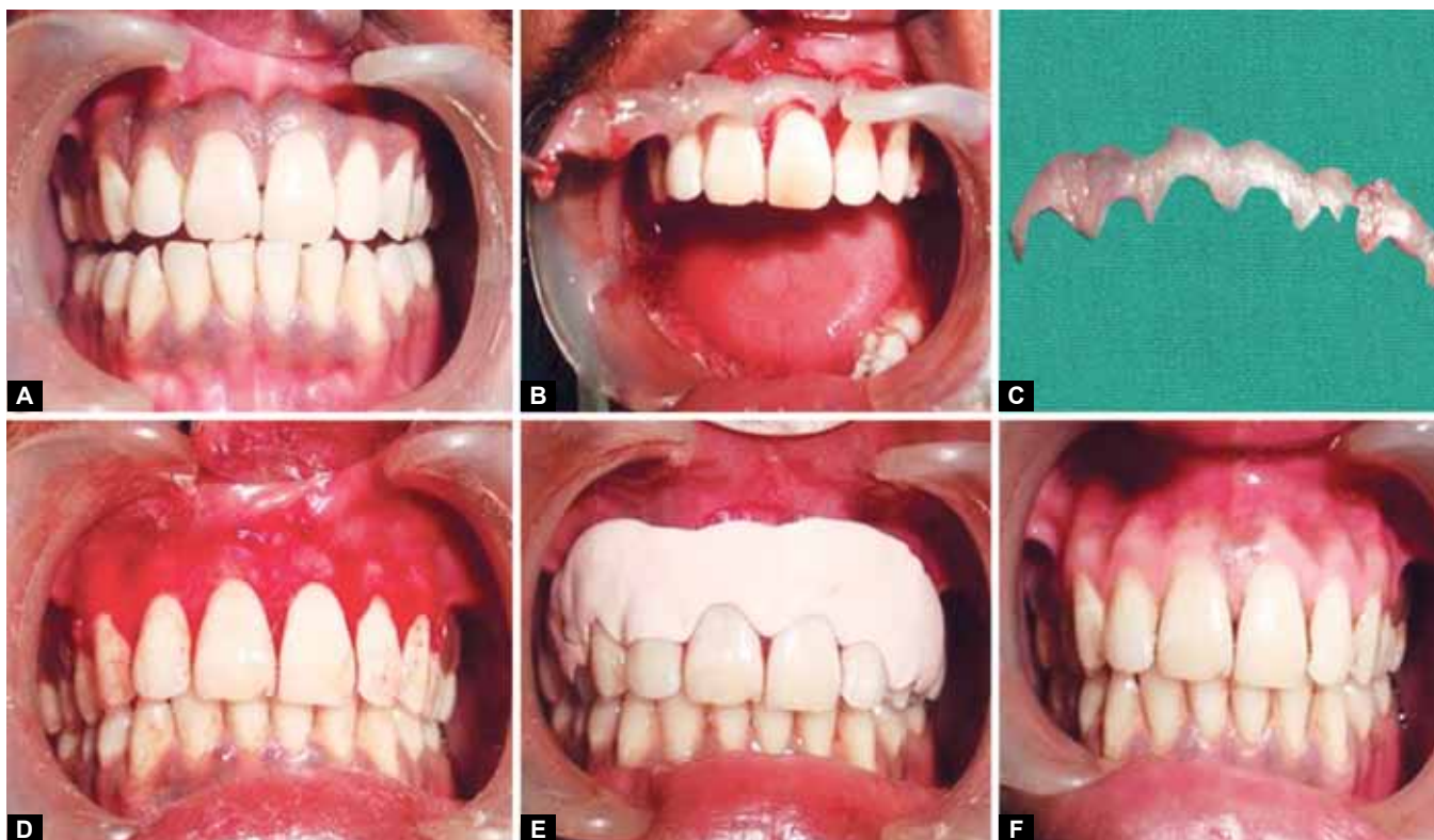
Figs 2A to F: Case 2: (A) Preoperative, (B) epithelium removed by scalpel technique, (C) removed epithelium, (D) raw area after de-epithelization, (E) periodontal dressing given and (F) postoperative after 1 year

was given from premolar to premolar area in maxillary arch. Blade no. 15 with Bard Parker handle was used. The entire pigmented epithelium (Figs 1B and 2B) was removed with the scalpel (Figs 1C and 2C) the bleeding was controlled with the pressure pack (Figs 1D and 2D). A noneugenol periodontal dressing was given (Figs 1E and 2E). Patient was advice antibiotic and analgesic postoperatively for 5 days. The patient was reviewed at the end of 1 week. Healing was uneventful without any postsurgical complication. The gingiva appear pink healthy and firm. The patient expressed satisfaction over the enhanced color of the gingival. At the end of 1 month, reepithelialization was complete. The cases were reevaluated again after 1 year (Figs 1F and 2F).