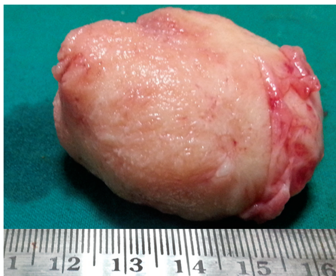
Fig. 2: Gross specimen of tumor after transoral excision

adequate clearance of the tumor with a cuff of surrounding dispensable normal tissues is the key to successful surgery. Pleomorphic adenoma has three malignant varieties: carcinoma expleomorphic adenoma, carcinosarcoma and metastasizing pleomorphic adenoma. Carcinoma ex pleomorphic adenoma is a rare mixed tumor developing from the epithelial component of the pleomorphic adenoma. 7-9 The malignant transformation in the pleomorphic adenoma has been linked to recurrence and multiple excisions, 10,11 laminin and collagen IV deposition. 12