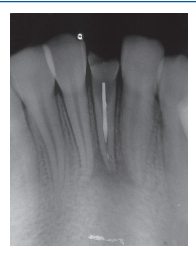
Fig. 2: Needle in the root canal with coronal radiolucency and widening of PDL space and apical radiolucency

examination revealed a radiopaque object extending from coronal to middle third of the root extending to apical third (Fig. 2). Coronally oval radiolucency was seen surrounding the radiopaque object. Due to the poor prognosis of the tooth it was decided to extract the tooth. Before attempting extraction, retrieval of needle was tried using an H-file. The object lodged was a sewing needle with a thread (Fig. 3). Patient was referred to department of orthodontics for correction of the existing malocclusion.