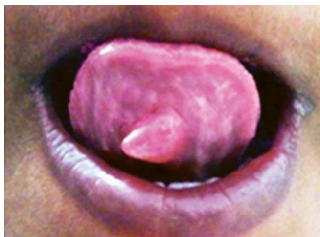
Fig. 1: The swelling on the ventral surface of the tongue

The given H & E stained soft tissue section shows surface epithelium associated with mucous extravasation. The lesional connective tissue comprises of haphazardly arranged collagen fibers admixed with muscle fibers and acini. Deeper down within the connective tissue shows empty space suggestive of mucin been washed and walled off by granulation tissue, resembling that of a cystic