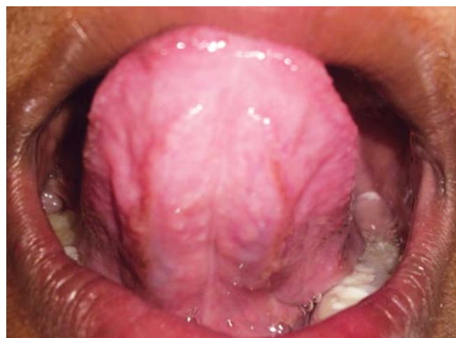
Fig. 5: Postoperative photograph after a period of 6 months