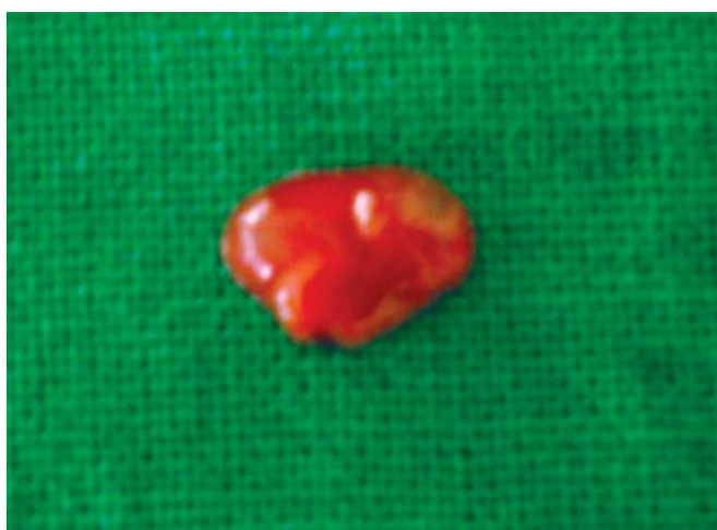
Fig. 3: Grossed tissue measuring about 15 × 10 mm