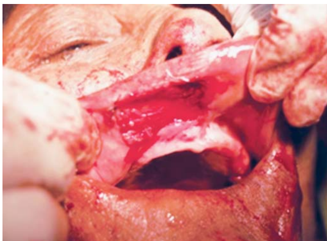
Fig. 3: Immediate postoperative view

The histopathological examination revealed an encapsulated tumor mass showing sheets and strands of small, cuboidal darkly staining ductal epithelium. At places cells were arranged in double layer surrounding cystic spaces with small, darker myoepithelial cells as distinct outer layer. The central spaces contained eosinophilic mucoid material. The fibrocollagenous stromal tissue showed deposition of hyaline material (Fig. 4). Thus, the provisional diagnosis was confirmed.