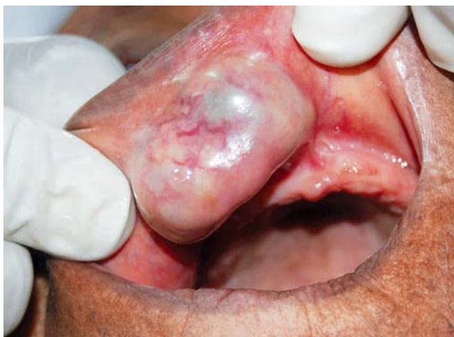
Fig. 2: Intraoral view