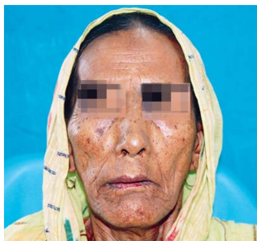
Fig. 1: Extraoral photograph