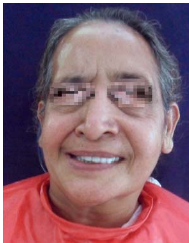
Fig. 7: Patient with lip plumper prosthesis