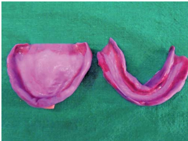
Fig. 3: Final impressions