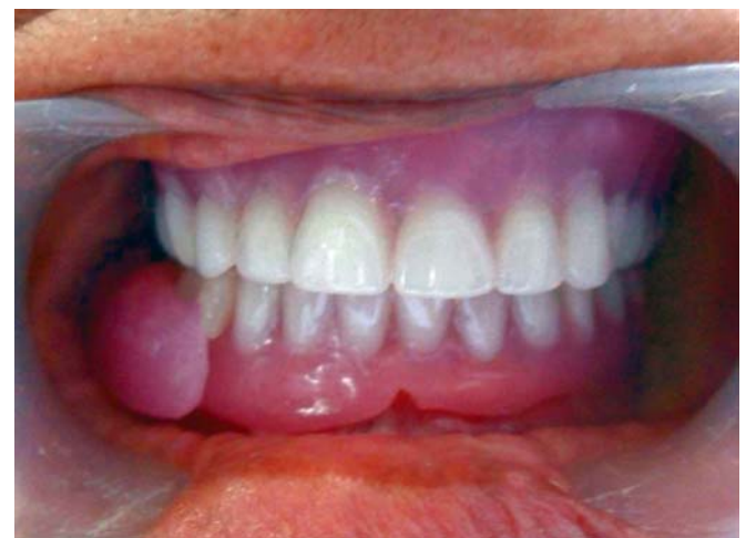
Fig. 6B: Intraoral view of denture with lip plumper prosthesis

were done separately with heat-polymerized acrylic resin. The complete denture with detachable lip plumper prosthesis was delivered to the patient (Figs 6A and B). The profile of the right lower lip of the patient was improved by wearing