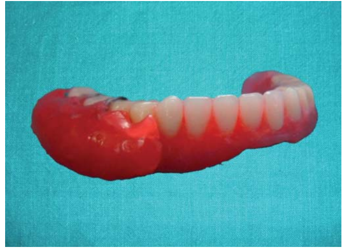
Fig. 5: Lateral view of wax-up of lip plumper retained with ball-end clasps