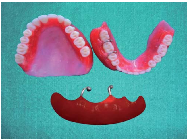
Fig. 4: Wax-up of lip plumper retained on mandibular trial denture