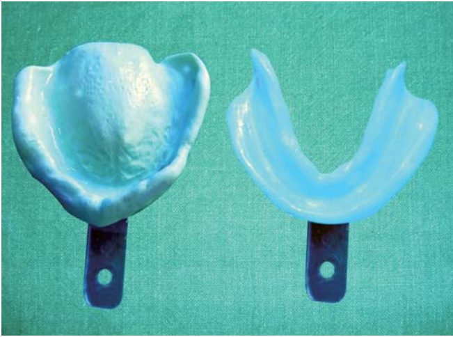
Fig. 2: Preliminary impressions