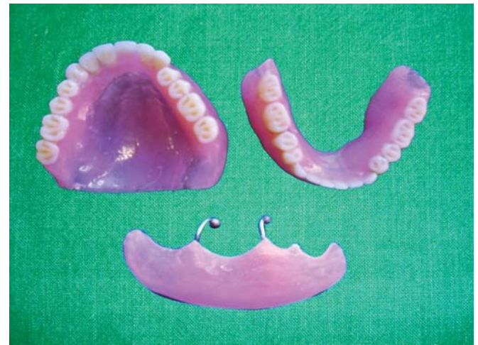
Fig. 6A: Cured denture with lip plumper prosthesis