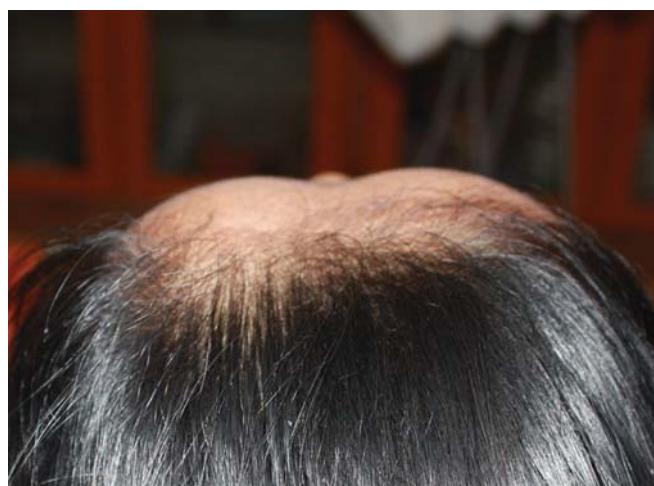
Fig. 2: Frontal bossing