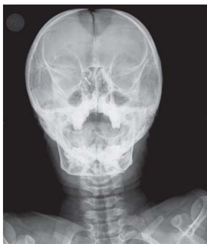
Fig. 5: Open anterior fontanelle

and hypoplastic zygoma. The anterior and posterior fontanelles were open. The lambdoid suture was also involved (Figs 5 and 6).