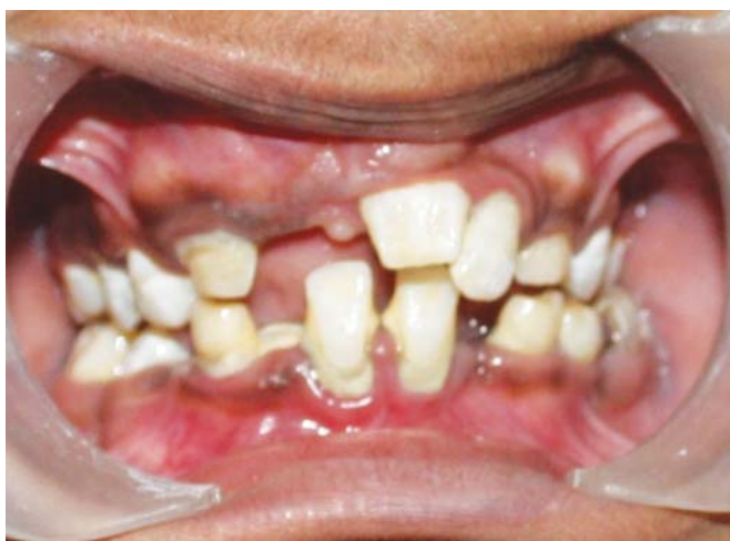
Fig. 3: Retained deciduous teeth and missing permanent teeth