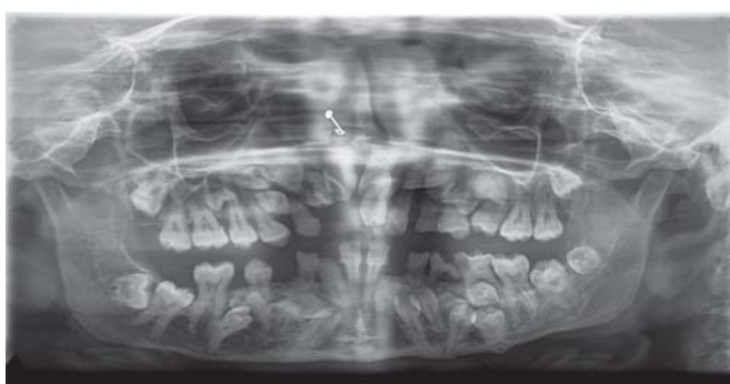
Fig. 4: Multiple unerupted supernumerary teeth