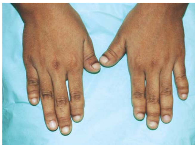
Fig. 1: Short thumbs and short terminal phalanges

A 17-year-old female patient came to dental clinic for cosmetic correction. On examination, she had brachycephaly, hypoplastic maxilla, hypoplastic zygoma, hypertelorism and concave facial profile. Her shoulders could be brought together at the midline. She had broad short thumbs and was of short stature (Fig. 1). She had sunken appearance on frontal bone (Fig. 2). Intraoral examination revealed multiple retained deciduous teeth and missing permanent teeth (Fig. 3). Radiographs showed multiple supernumerary impacted teeth (Fig. 4). There were absent nasal bones, hypoplastic maxilla