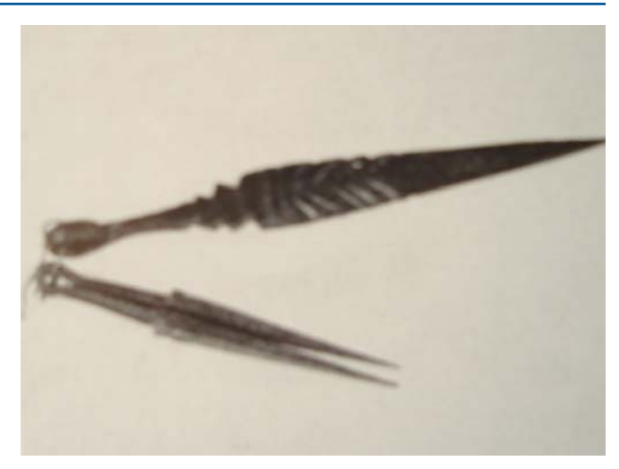
Fig. 2: Beard tweezers and toothpick: Sushruta and Samhita

The miswak is predominant in Muslim areas but its use predates the inception of Islam.<sup>5,6</sup> It is often mentioned that Muhammad himself recommended its use. Mohammed was