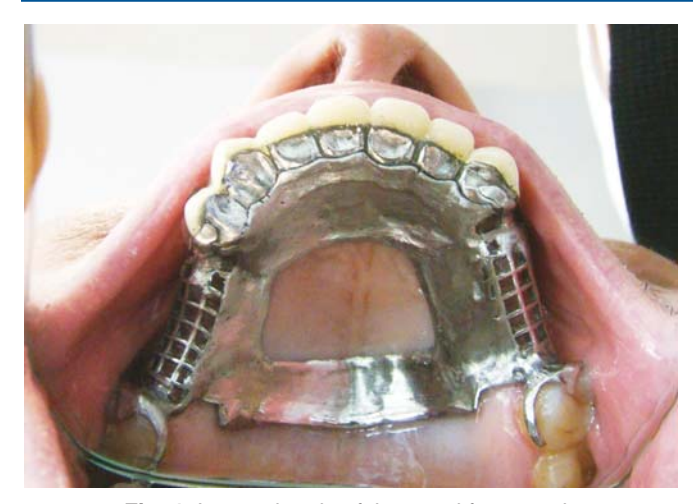
Fig. 4: Intraoral try-in of the metal framework