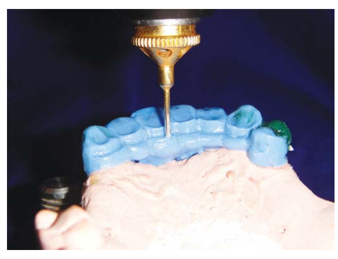
Fig. 2: Wax contour FPD and milled in wax on the palatal surface and in cingulum areas to create a positive rest and guide plane components

The fabrication of the cast partial denture began with block out of the definitive cast which then was duplicated using agar (Wirogel M; Bego, Germany) and poured in phosphate bonded investment (Wirovest; Bego, Germany). The major connector used was anteroposterior palatal strap (Smooth casting wax; Bego, Germany). A cast clasp was placed into a 0.010 inch undercut on the mesiobuccal of the right and left second molars