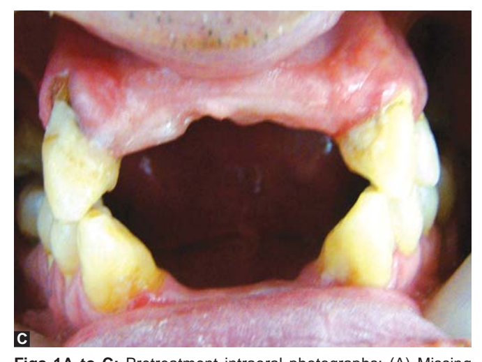
Figs 1A to C: Pretreatment intraoral photographs: (A) Missing mandibular incisors, (B) missing maxillary incisors, billateral second premolars and molars and right first premolar, (C) frontal view of missing maxillary and mandibular incisors

The fabrication of the cast partial denture began with block out of the definitive cast which then was duplicated using agar (Wirogel M; Bego, Germany) and poured in phosphate bonded investment (Wirovest; Bego, Germany). The major connector used was anteroposterior palatal strap (Smooth casting wax; Bego, Germany). A cast clasp was placed into a 0.010 inch undercut on the mesiobuccal of the right and left second molars