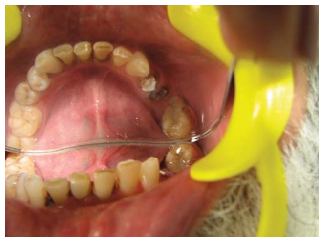
Fig. 1: Intraoral view of impacted molar

A panoramic radiograph (Fig. 2) showed that the mesially inclined tooth on lower left side was the third molar. The mandibular second molar was deeply impacted and horizontally placed. Distal cusp of the first molar was at the level of the occlusal surface which was in infraocclusion and revealed resorbed roots. The third molar lay above and parallel to the second molar (Fig. 3). The roots of the first molar were resorbed due to the presence of the horizontally impacted second molar. All the remaining third molars were impacted.