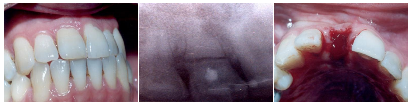
Figure 1 -Initial clinical situation, Figure 2 - Radiological examination highlightingfracture of root and splint, Figure 3 - Extraction of 11 and hemostasis