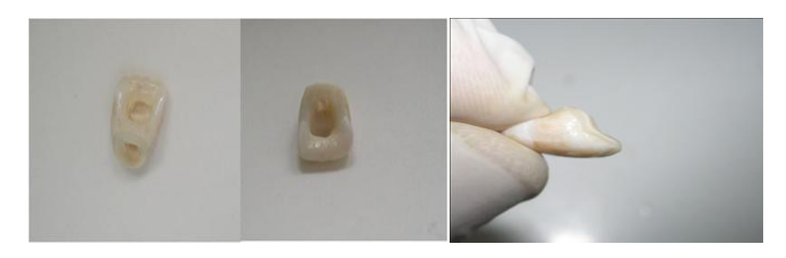
Figure 7 - Preparation of the crown after trephination, Figure 8 - Preparation of the crown: the face in relation to edentulous ridge takes the form of a modified saddle