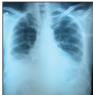
Figure 1: X-ray chest showing bilateral blunting of costophrenic angle.

On examination, his vitals were stable. His blood pressure was 126/78mmHg, pulse rate was 76/min regular and respiratory rate of 18/min. General physical examination was inconclusive. Presently, there were no tender swollen joints or any subcutaneous nodule. Respiratory examination revealed decreased bilateral air entry in infra-scapular and infra axillary area with stony dullness on percussion and fine end-inspiratory crackles.