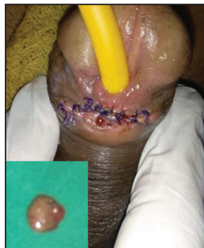
Figure 2: Complete excision of the cyst was performed under spinal anesthesia (Gross appearance of the cyst).