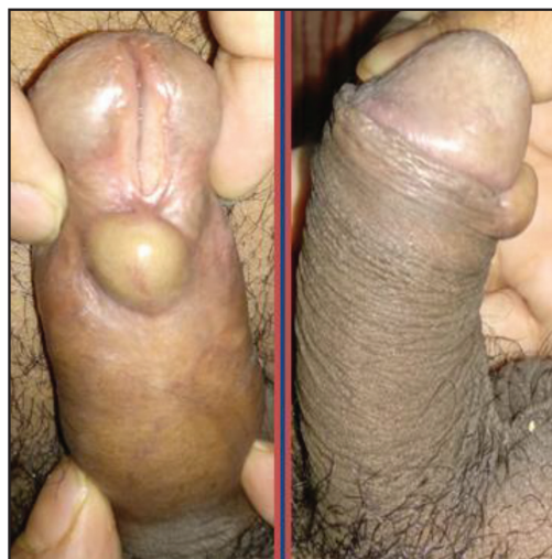
Figure 1: Preoperative image showing a mobile, painless mass on the ventral aspect of the frenulum of the penis with coronal hypospadias.

A 44-year-old man came to the surgery clinic with a complaint of slow-growing penile swelling. The penile mass was noticed at the age of 6 years by the parents during bathing. The subcoronal hypospadias was also present since birth. The patient was married and has 2 children. The medical history including urinary tract infection, dysuria, hematuria, trauma was otherwise unremarkable.