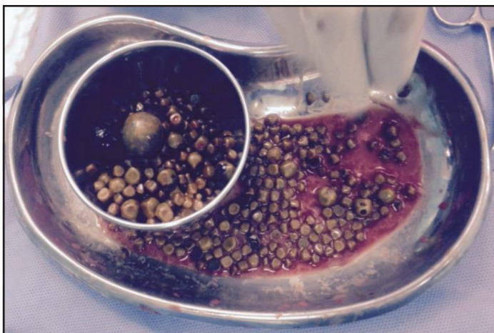
Figure 3: More than 300 stones of different sizes removed from GB via open cholecystectomy

Pre and Post-operatively, the patient was managed as per surgical unit protocol. The patient did well during the hospital stay and discharged on the 12 th postoperative day with a week