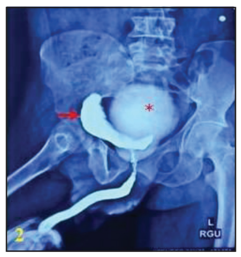
Figure2: Retrograde urethrogram showing (arrow) urinary bladder, (asterix) utricle cyst

The patient was discharged on the fourth postoperative day and the catheter was removed on the tenth day.