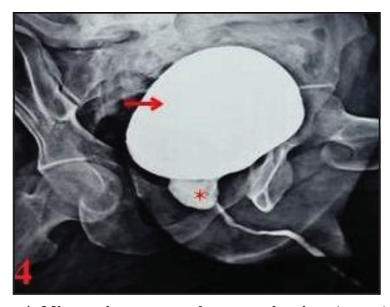
Figure 4: Micturating cystourethrogram showing- (arrow) urinary bladder and (asterisk) remnant cyst