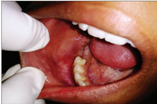
Figure 3: Intraoral clinical photograph during incisional biopsy