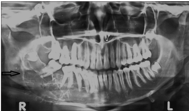
Figure 2: Radiograph showing honeycomb and sunburst appearance