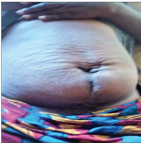
Figure 2: Follow-up of the patient after 6 months showed no recurrence of the condition

section [4-7]. Our patient had a history of laparotomy and total abdominal hysterectomy. The incisional hernia can present early after surgery or many years subsequently [8]. Our patient presented early (3 months) after the primary surgery.