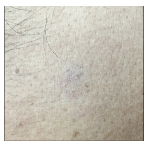
Figure 1: Clinical picture shows light purple coloring of skin overlying the lesion