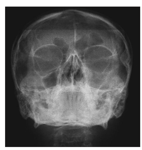
Figure 3: Paranasal sinus view showing haziness in the left maxillary sinus

erosions, destruction, and sclerosis; and extension into the left retromaxillary space, middle meatus and into the orbit; with loss of fat plane (Fig. 4). Radiographically, it was diagnosed to be having neoplastic lesion symptoms pertaining to the left maxillary sinus. Incisional biopsy was performed which showed extensive necrosis and scattered pleomorphic squamous cells with a hyperchromatic nucleus (Fig. 5). Histopathologically, it