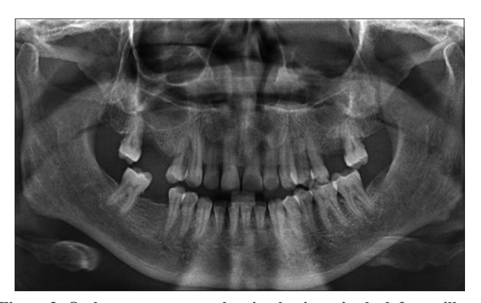
Figure 2: Orthopantomogram showing haziness in the left maxillary sinus