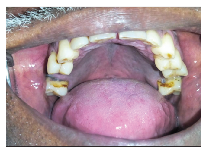
Figure 1: Intraoral photograph showing attrition in upper left anterior teeth