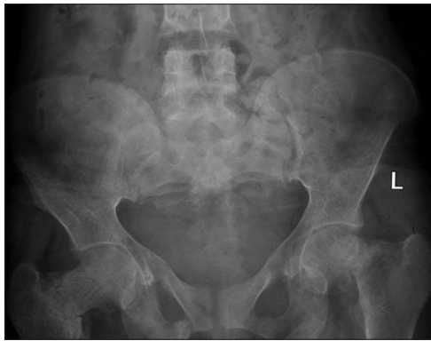
Figure 1: X-Ray of the hip showing pseudofracture of the right hip joint and pathological fracture of the left hip joint

Twenty-five percent of patients with Sjogren's syndrome have distal RTAs [4]. The possible mechanism of distal RTA in Sjogren syndrome is an absence of H + -ATPase pump in intercalated cells in the collecting tubules due to immune-mediated injury leading to decreased secretion and hence retention of hydrogen ions [5], which leads to increased excretion of potassium ions in exchange for sodium reabsorption in collecting tubules to maintain electroneutrality [6]. The other mechanism is of defective H + -ATPase pump which leads to sodium wasting hence stimulation of angiotensin-aldosterone activity causing hypokalemia [7].