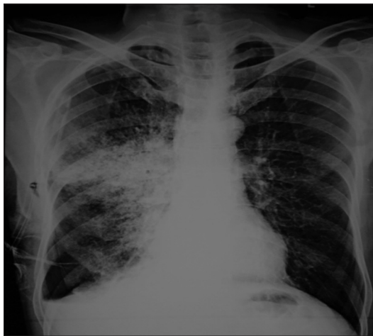
Figure 2: Chest X-ray showing homogenous opacity on the right side with intercostal tube in place and minimal pneumothorax

kept, and he was managed with supplemental oxygen and NIV support. The exact mechanism responsible for RPE is not known, but cause may be multifactorial. Many studies have shown it to develop after microvasculature injury resulting in permeability edema [4]. There is thickening of capillary endothelium and basement membrane due to prolonged lung collapse. On lung reexpansion, these altered vessels get damaged due to stretching resulting in the development of RPE.