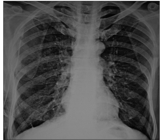
Figure 4: Chest X-ray showing expanded lung and resolution of pulmonary edema

Severe hypoxemia may require mechanical ventilation. Diuresis should be avoided due to volume depletion [8]. RPE may be prevented by allowing slow decompression; the volume of fluid being drained during thoracentesis should usually be limited to 1–1.5 L. The ICT should be first connected to underwater seal drainage bag rather than applying negative pressure.