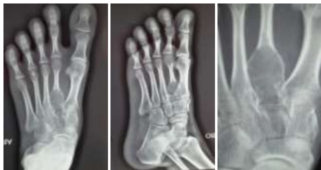
Figure 1: Plain radiographs of Left foot. (a) AP, (b) Lateral and (c) magnified AP views. There is an expansile lesion of GCT of epiphyseal region of second metatarsal with multiple thin inner trabeculations.

beyond the joint. The working diagnosis of GCT was made on the basis of the clinical and radiological findings.