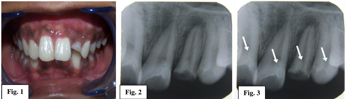
Figures: Fig 1 - Class II division 1 malocclusion. Fig 2 - IOPAR showing hazy radiolucency of around 1 cm in diameter with ill defined irregular borders in the periapical region of 22. Fig 3 - Showing radio opaque extensions from coronal part of tooth into the pulp chambers of 11, 21, 22, and 23.

Radiographic diagnosis was chronic periapical abscess of maxillary left lateral incisor. The case is provisionally diagnosed as multiple dens in dente affecting the maxillary anterior teeth. The lesion was managed by abscess drainage and root canal treatment on 22. Since rests of the teeth were without any pulpal or periapical involvement, prophylactic restoration of deep pits of 12, 11 and 21 was done.